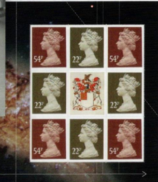
From far left: country definitives, panes 2 and 3 of the Festival of Stamps Prestige Stamp Book, and panes from the Britain Alone, the Royal Society, and the Album Art Prestige Stamp Books

8 May The King's Stamps (MZ065), E, I, PVA; London 2010 Exhibition Sheet (MZ066), C, L, PVA.